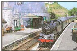
Swanage Steam Railway