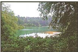
The Blue Pool